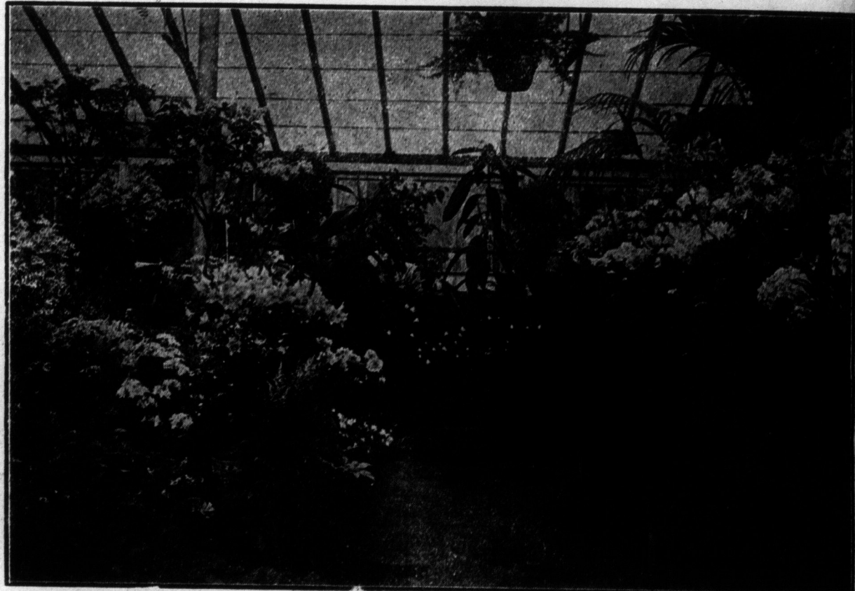
The Easter Flower Show, held in the southeast greenhouse at Allan Gardens, April 23 and 24.