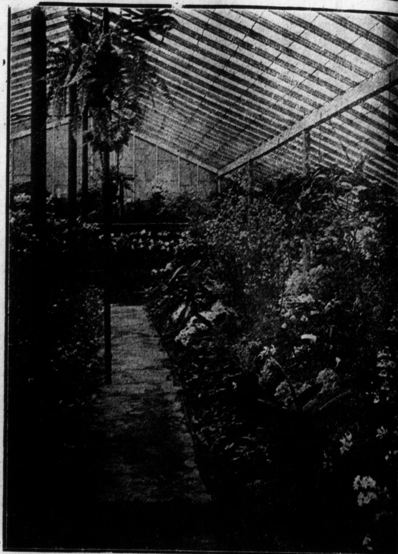
A mass of flowers and foliage that made the fancier's heart joyful.