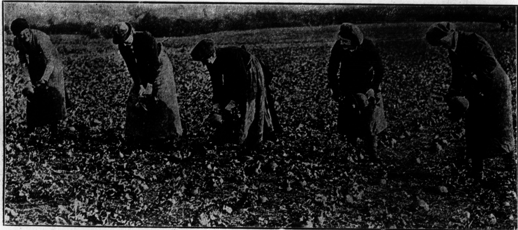
Some of England's "new women" at work in a turnip field in answer to the government's call for female agricultural laborers