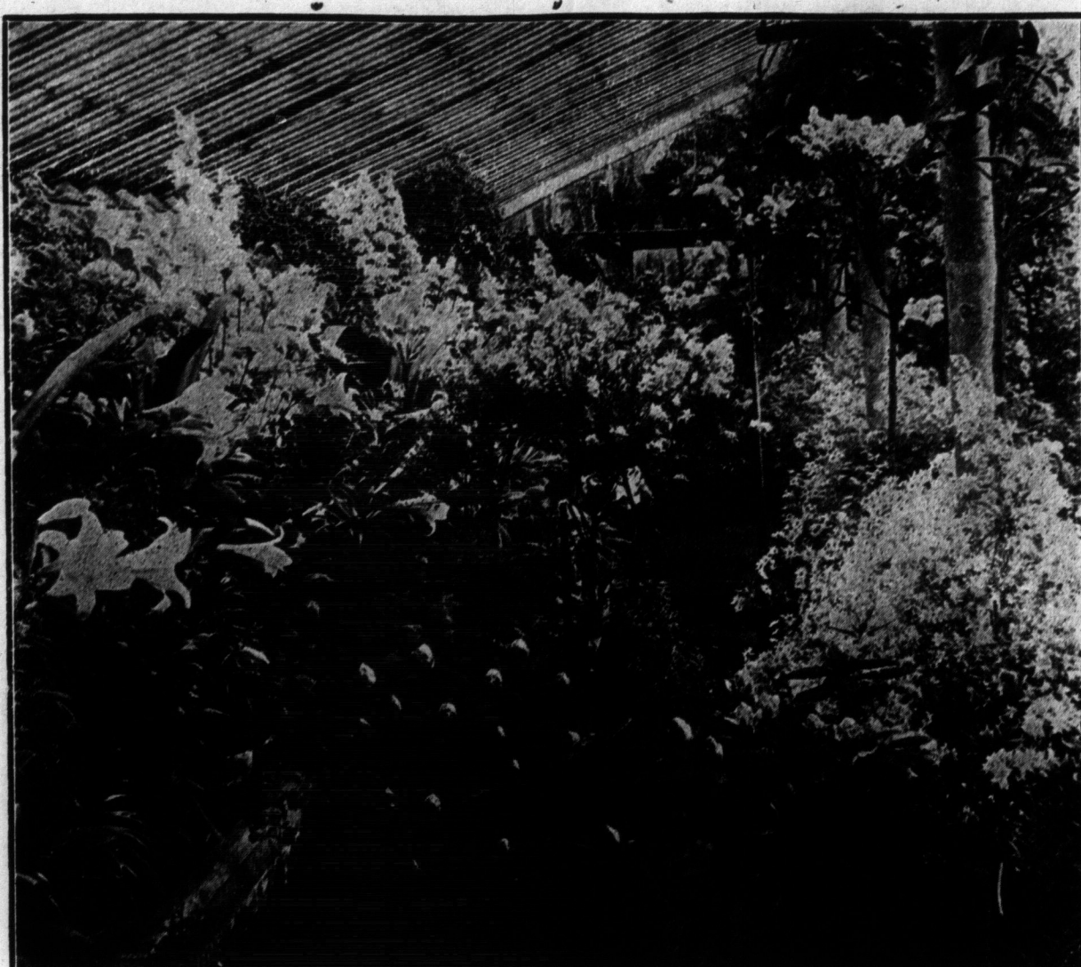
A fine variety of blooms and green in one corner of the greenhouse at Allan Gardens.