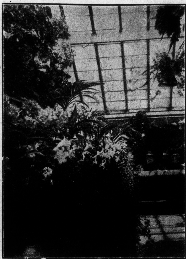
This huge bank of Easter lilies could not have been more imposing.