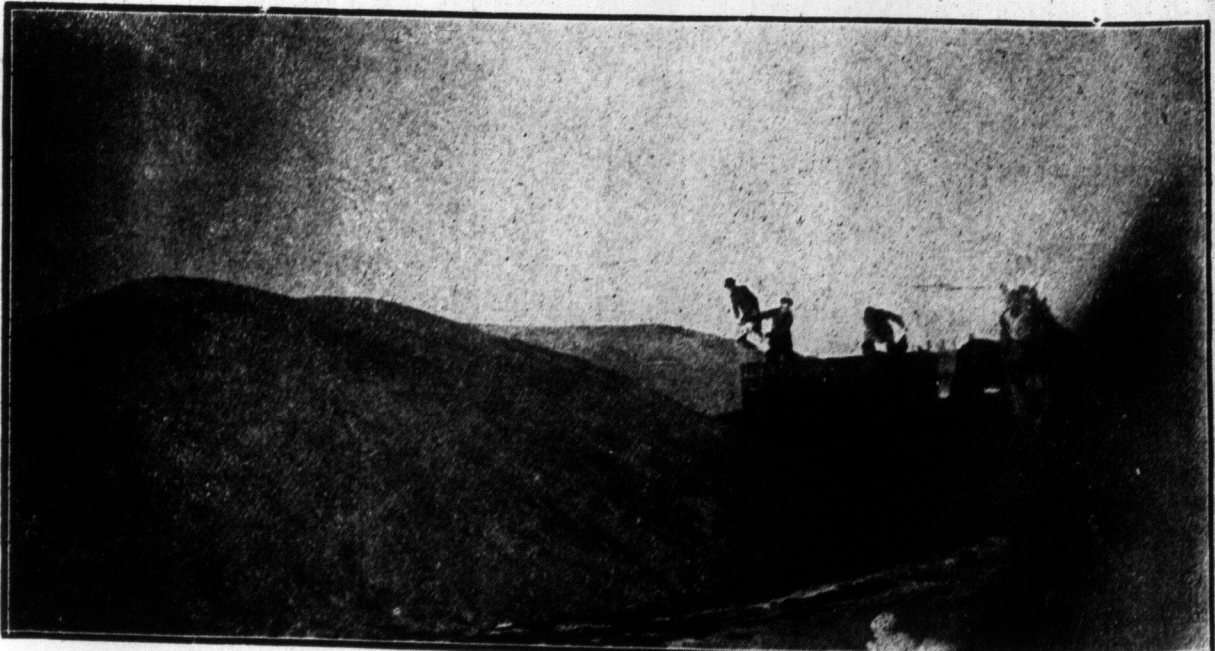
A pile of wheat of 50,000 bushels at Webb, Sask., where the scarcity of freight cars has compelled farmers to risk their grain this way after hauling to the elevators already filled.

RIDER 1916 Model BUY until you to-day. MYST