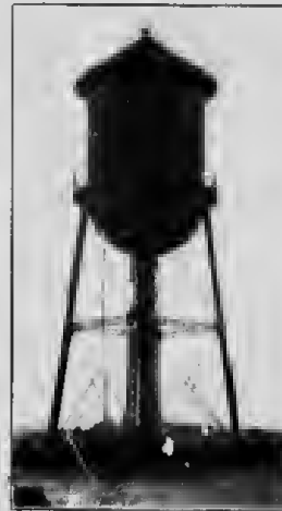
SPRINKLER TANK ON ROOF OF BUILDING. Capacity, 10,000 gallons. Height, 30 ft. to bottom.

Upon request, we will be pleased to mail you a copy of our latest Canadian catalogue, No. 11.