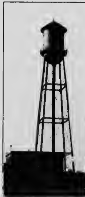
SPRINKLER SYSTEM, GOLDIE & McCLELLAN CO., LTD. Capacity, 10,000 gallons. Height, 88 ft. 6 in. to bottom.