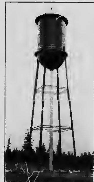
CITY WATER WORKS, FIFTY FRANCES, ONTARIO. Capacity, 100,000 gallons. Height, 51 ft. to bottom.