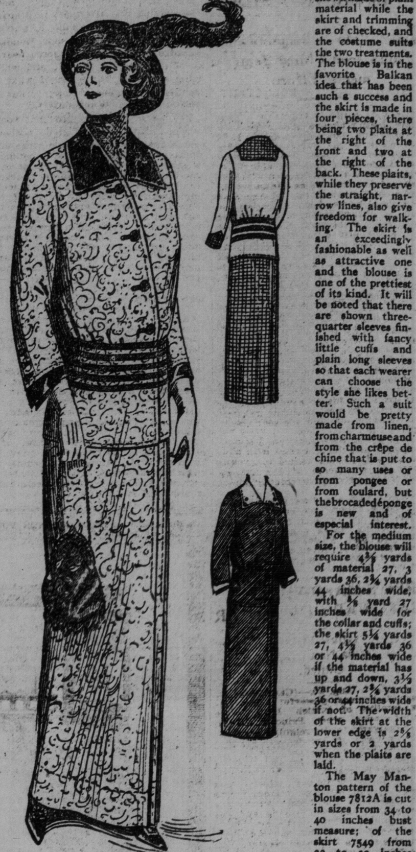
7812A Blouse Coat, 34 to 40 bust. 7549 Four-Piece Skirt, 22 to 32 waist.

BOCADED éponge is a fashionable material, exceedingly comfortable and pleasant for midsummer wear. This costume shows it trimmed with a little plain colored silk and with braid. In another view, the blouse is shown made of plain material while the skirt and trimming are of checked, and the costume suits the two treatments. The blouse is in the favorite Balkan idea that has been such a success and the skirt is made in four pieces, there being two plaits at the right of the front and two at the right of the back. These plaits, while they preserve the straight, narrow lines, also give freedom for walking. The skirt is an exceedingly fashionable as well as attractive one and the blouse is one of the prettiest of its kind. It will be noted that there are shown three-quarter sleeves finished with fancy little cuffs and plain long sleeves so that each wearer can choose the style she likes better. Such a suit would be pretty made from linen, from chambray and from the crêpe de chine that is put to so many uses or from pongee or from foulard, but the bocadoed éponge is new and of especial interest.