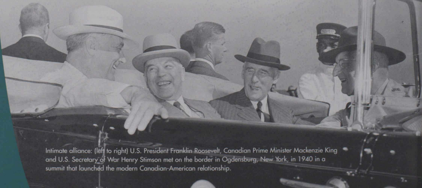
Intimate alliance: (left to right) U.S. President Franklin Roosevelt, Canadian Prime Minister Mackenzie King and U.S. Secretary of War Henry Stimson met on the border in Ogdensburg, New York, in 1940 in a summit that launched the modern Canadian-American relationship.

Borders do matter, but they can have more than one meaning. The long and porous Canada-U.S. frontier fosters similarity and cooperation. Canada and the U.S. are interdependent, their pasts and their futures woven together inextricably and inevitably. It isn't fashionable to say it, but the border people have far more in common with their southern neighbours than most dare admit. 🍁