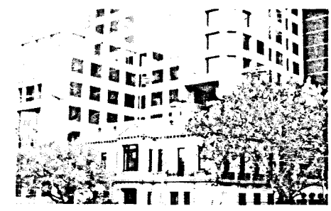
The Canadian Embassy in Melbourne. We occupy the 6th floor.

The chancery, with its enclosed atrium and surrounding patios, provides a pleasant work environment and the well designed residences and recreational facilities will no doubt contribute greatly to one's enjoyment of a posting to Beijing, China.