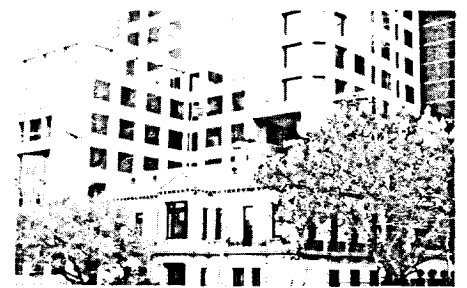
The Canadian Embassy in Melbourne. We occupy the 6th floor.

The chancery, with its enclosed atrium and surrounding patios, provides a pleasant work environment and the well designed residences and recreational facilities will no doubt contribute greatly to one's enjoyment of a posting to Beijing, China.