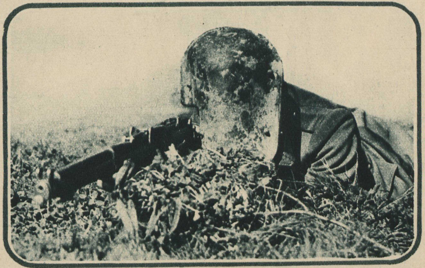
German sniper's helmet. Made of \frac{1}{2} -inch Krupp steel, it is so heavy that it can only be used when resting on some object.