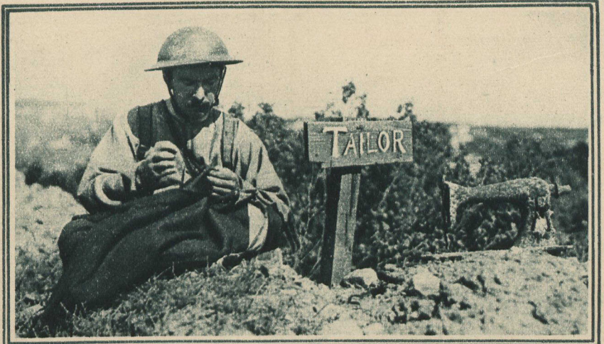
"At the sign of the Sewing Machine." A Canadian tailor having dug up an ancient sewing machine immediately opens up shop.