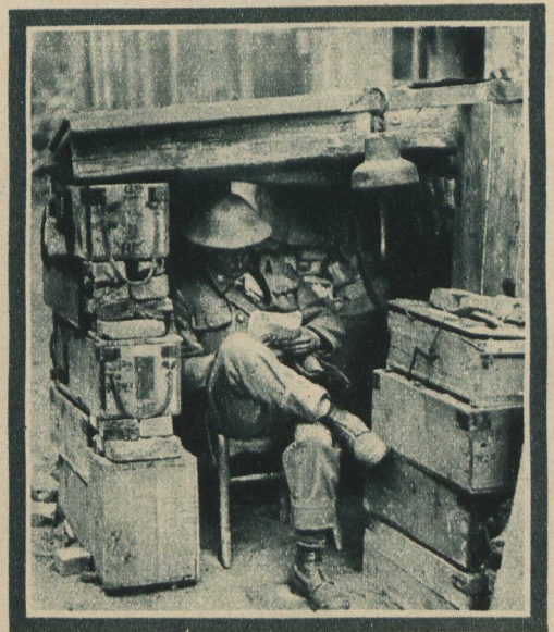
The gas alarm man. When the gas is signalled, the sentry rings the bell.