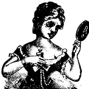
A skin of beauty is a joy forever.