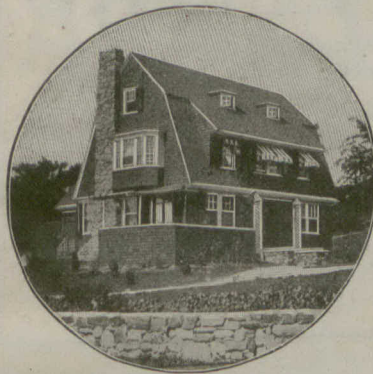
Clark &amp; Russell, Architects, Boston, Mass.

The Original and Standard Shingle-stains. Used and proved in every climate for over twenty years. Every gallon guaranteed.