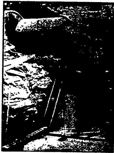
Sherbrooke Street Railway Power Plant—45 inch Crocker Wheel in Horizontal Setting.

CANADIAN BRANCH: 22 Sheppard Street, TORONTO