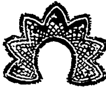
COLLAR—Pure Idem. $1.00.

BUY some of this hand-made Pillow Lace, it lasts MANY times longer than machine made variety, and imparts an air of distinction to the possessor, at the same time supporting the village lace-makers, bringing them little comforts otherwise unobtainable on an agricultural man's wage. Write for descriptive little treatise, entitled "The Pride of North Bucks," containing 100 striking examples of the lace makers' art, and is sent post free to any part of the world. Lace for every purpose can be obtained, and within reach of the most modest purse.