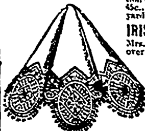
DAINTY HANDKIE—70c. No. 922—Lace 1 1/2 in. deep.

Collars, Fronts, Plaques, Jabots, Yokes, Fichus, Berthes, Handkerchiefs, Stocks, Camisoles, Chemise Sets, Tea Cloths, Table Centres, L'Oyces, Mats, Medallions, Quaker and Peter Pan Sets, etc., from 25c. 60c., $1.00, $1.50, $2.00 up to $5.00 each. Over 100 designs in yard lace and insertion from 10c. 15c., 25c., 45c., up to $3.00 per yard.