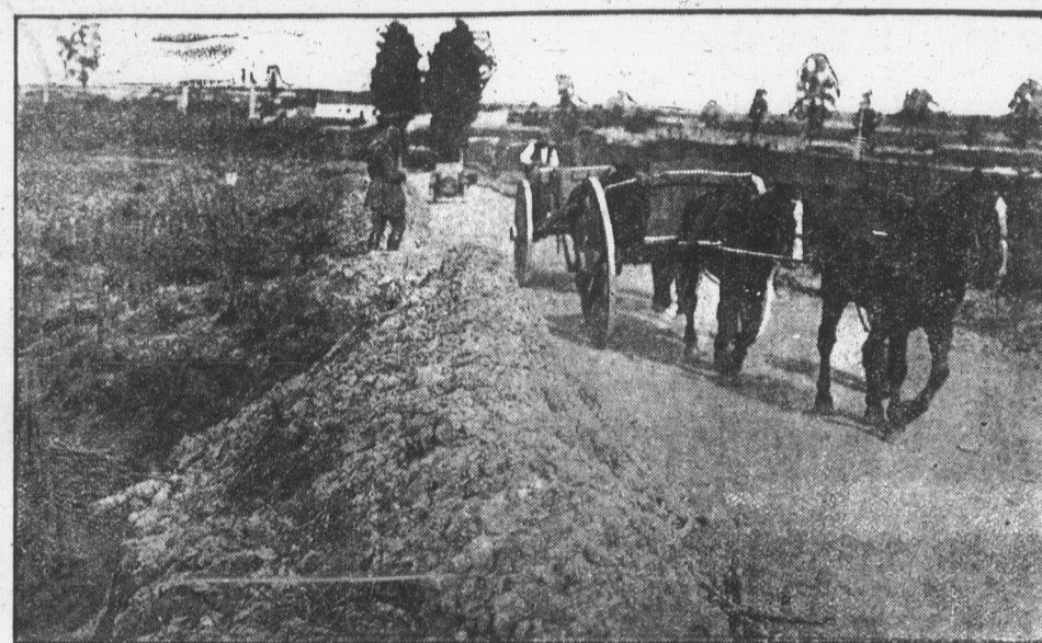
The British advance in the West.—Farmers back among the trenches