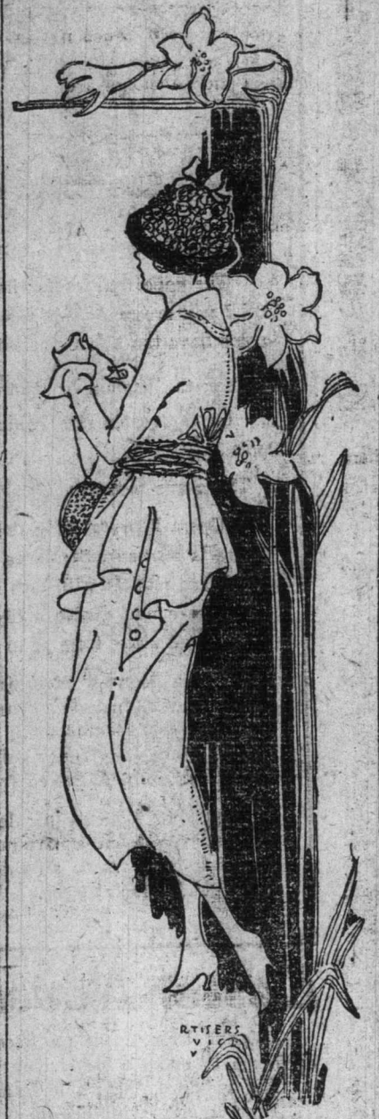
Straight and Narrow lines form the pleasing features of the New Tailored Suit.

Ottawa, April 10.—Representatives of postal employees continued their conferences yesterday with Dr. Coulter, Deputy Postmaster-General. The discussions were with delegates from Eastern as well as Western points. The men's demands are being taken up in detail.