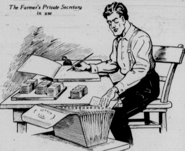
The Farmer's Private Secretary in use

Make all the money you can out of your grain by doing your business right. Have copies of all your letters and keep them in a file where you can put your hand on them instantly. You can then keep your business in just as good shape as any business man in the city. Many farmers would have saved from $10 to $50 on a car of grain alone if they had kept copies of all their letters and saved them to avoid disputes. The Farmers' Private Secretary is prepared specially for farmers. It contains the following: One Letter File, like the picture, 11 1/2 by 9 1/2 inches, with a pocket for each letter of the alphabet. This file when closed is only 1 1/2 inches thick, but it opens like an accordion and will hold 1,000 letters. Made of tough paper reinforced with linen. It will last 20 years if handled with care. Two Handsome Grecian Bond Writing Tablets, each containing 90 sheets of ruled paper 8 by 10 1/2 inches (to fit the file) and bound in a beautiful cover with two full size blotters. One Hundred fine quality white Envelopes. Six Sheets "Manifold" Carbon Paper, same size as writing tablets, for taking copies of your letters. Six "Manifold" Pens specially made for making carbon copies of letters. Ordinary pens will not serve the purpose. One Set of Complete Instructions. The whole outfit is all sent in one order, carefully packed and all charges prepaid. Postpaid