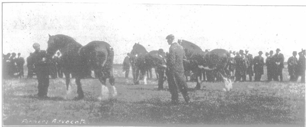
REGINA STALLION SHOW. Perpetual Motion.