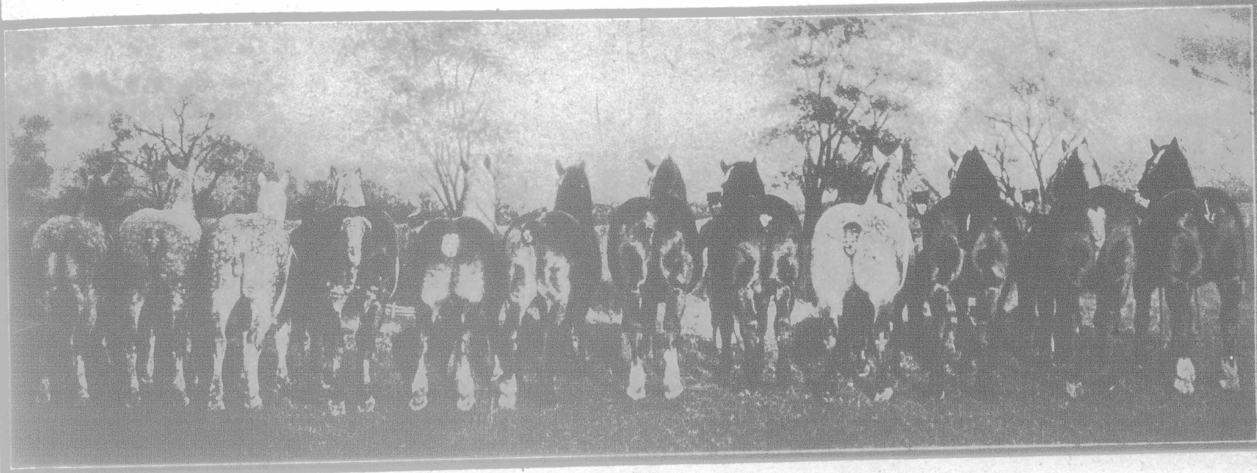
A GROUP OF OUR PERCHERONS AND BELGIANS