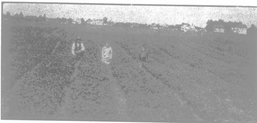
In Berry Time.

It is estimated that four pounds of grain will produce a pound of gain in chickens. Think of the grain going to waste in the fields after harvest and what it would mean to have it converted into poultry products. Elaborate buildings are unnecessary to accommodate chickens in the field. Colony houses are preferable of course, but large, dry-goods boxes, piano boxes put back to back and other conveniences will answer. With