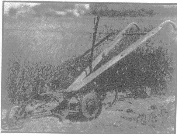
A Berry Grower's Cultivator.

it the same season with millet or potatoes. However, since the field illustrated is clean it was decided to retain it for another year. It is necessary to get new growth and keep down weeds. This will be accomplished by cutting and burning the foliage, plowing between the rows and cultivating. The rows as they now appear will be reduced to one foot in width by the cultivation, yet the new growth which is thus encouraged should make the field quite profitable another year.