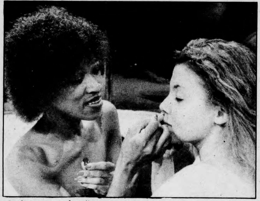
Lesbianism, and an "inventory of grime."