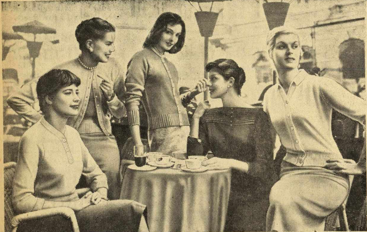
Photographed at Doney's, the famous sidewalk cafe in Rome on the fashionable Via Veneto

There will be two more issues of the Gazette, one next week and one at graduation. But now it is time for those of us who can to get down to studying.