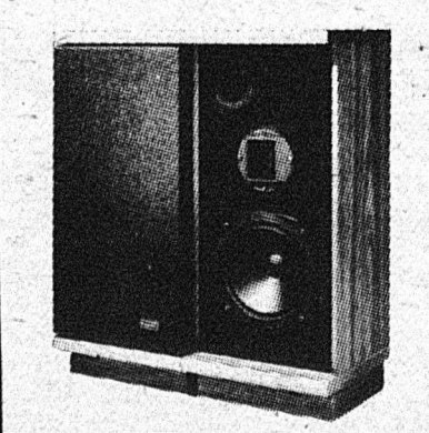
EDMONTON'S NEWEST SOUND ROOM!

2-Way Woofer: 8 in. — Gathered-edge suspension — Tweeter: 2½ in. — CONE TYPE — Max. Input Power — 50W (MUSIC).