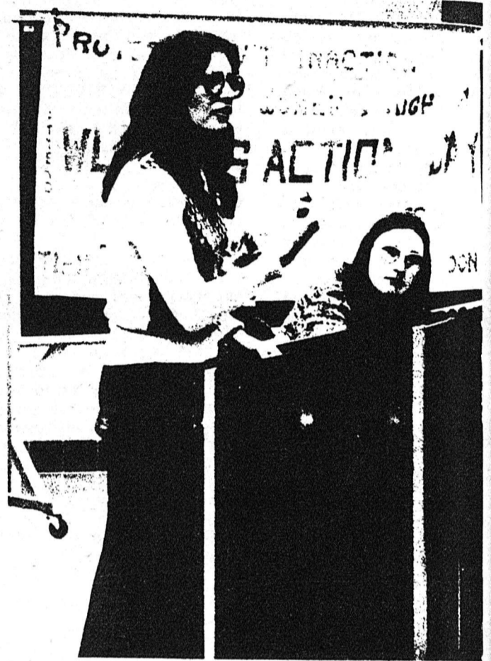
Lengthening the harangue against the government's misrepresentation, called IWY.