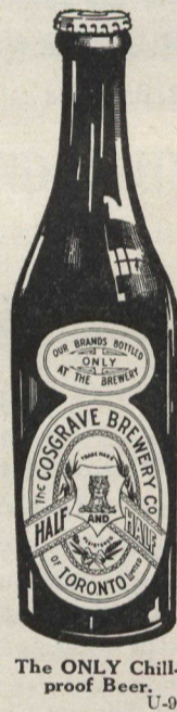
The ONLY Chill-proof Beer.

Telephone your dealer to send a case to your home.