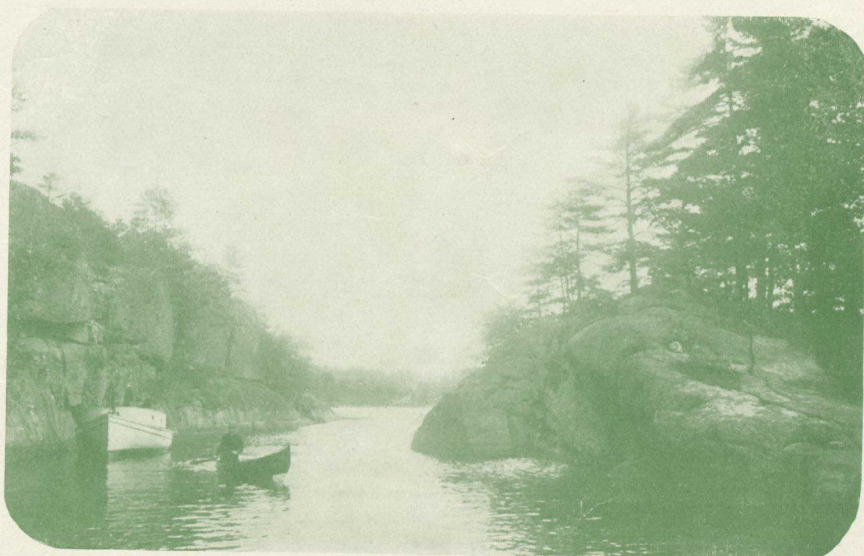
"HOLE IN THE WALL," NEAR POINT AU BRIL.

Dry, cool, invigorating balsamic air makes Point au Baril a desirable summer resort for those desiring to have a change of air and at the same time enjoy a summer outing.