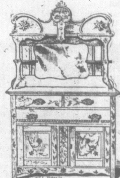
No. 598—Sideboard, Ash, antique finish, 18x24 in., shaped mirror, top 18x46 in., one long drawer, two small drawers (one lined for silver) 13.50.

Write for our Illustrated Furniture Catalogue.