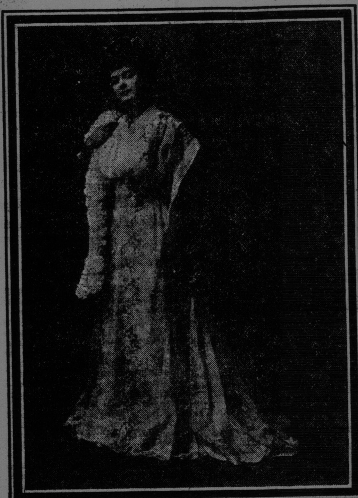
THE CHARM OF THE JAPANESE MODE.

With such beautiful, soft, flimsy fabrics as we are now using in dressy costumes, and the charming modes which are followed in the development of these toilettes, it would be strange indeed if dinner and evening gowns of this summer time were not the most fascinating we have seen in many a season. One of the most beautiful materials which women of fashion are using this season in dressy frocks for evening wear are those exquisite cloudlike printed chiffons which seem so well adapted to the picturesque Japanese idea. A semi-princess effect is described in this