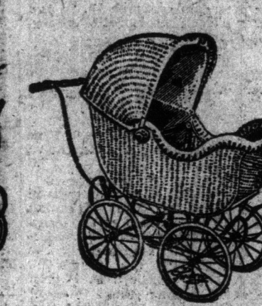
This stylish carriage has full fine hood, roof, dash and hood, richly upholstered in rich corduroy and seat cushions, has large rubber-tired wheels, either auto or coach gear. Reg. $22.00. Special $16.75. $3.50 Cash, $1.00 Weekly. LIKE CUT.