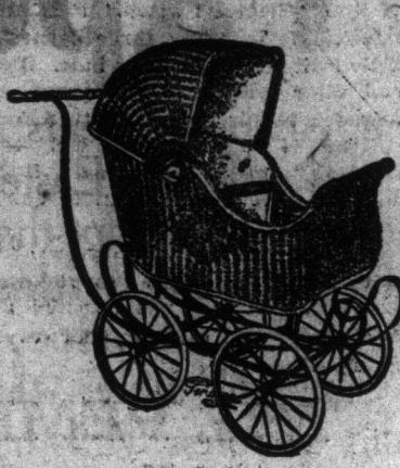
This large all-wood carriage, fitted with coach gear, rubber-tired wheels, foot brake, adjustable hood, upholstered in rich corduroy goods. Regular $14.00. Special $10.25. $4.00 Cash, $1.00 Weekly. LIKE CUT.