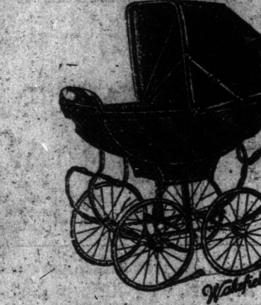
This handsome wood body English carriage has hood, strap gear and fitted with the large and small rubber-tired wheels. This is a very easy and comfortable riding carriage. Regular $23.50. Special $22.00. $5.00 Cash, $1.00 Weekly. LIKE CUT.