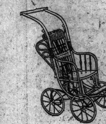
This useful carrier has drop back, strong spring gear, and fitted with rubber tires, has cane back and fancy sides. A very restful carrier. Regular $3.75. Special $2.95. $1.00 Cash, $1.00 Weekly. LIKE CUT.