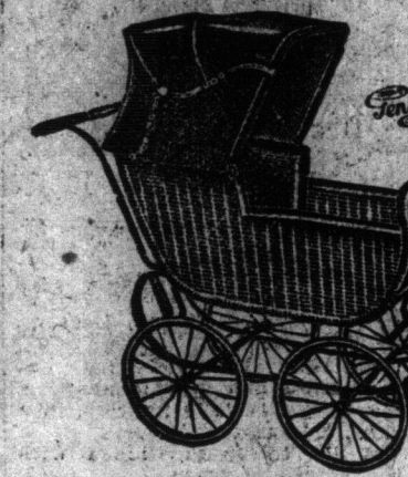
This closely woven carriage has hood, roof, dash and hood, richly upholstered in rich corduroy and seat cushions, has large rubber-tired wheels, either auto or coach gear. Reg. $22.00. Special $16.75. $3.50 Cash, $1.00 Weekly. LIKE CUT.