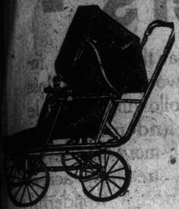
This all-steel carriage has folding hood, rubber wheels, adjustable foot board, drop back, strongly made. Regular $3.50 for... $5.95 LIKE CUT.