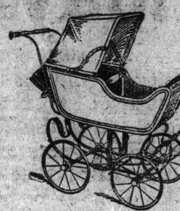
This small all-wood carriage, fitted with coach gear, rubber-tired wheels, foot brake, adjustable hood, upholstered in rich corduroy goods. Regular $11.00. Special $8.45. $2.00 Cash, $1.00 Weekly. LIKE CUT.