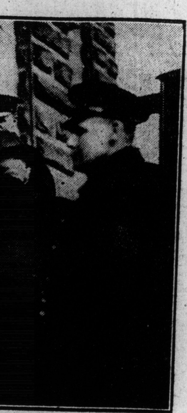
The World staff photographer was able to get the above picture of the men accused of participation in a series of recent crimes in Toronto, including the murder of Druggist L. C. Sabine, ascending the steps of Toronto jail, closely watched by the police, after appearing in the police court. They will appear again in court on March 15.