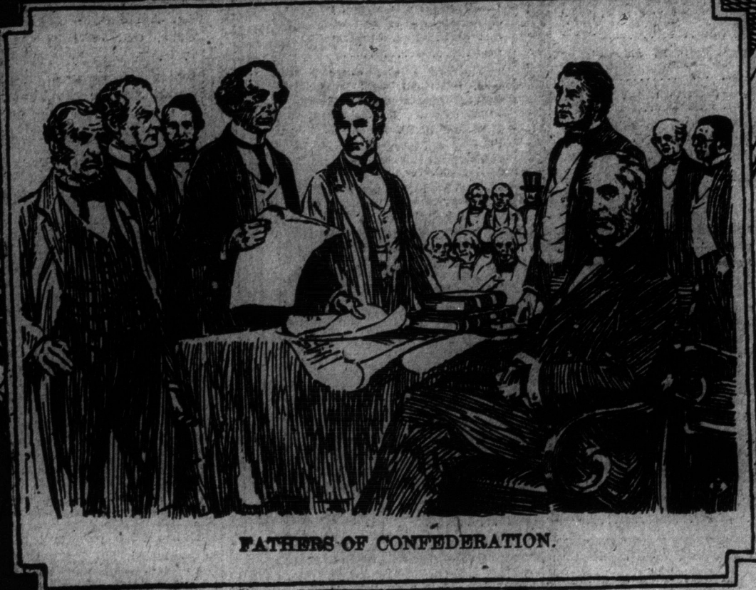
FATHERS OF CONFEDERATION.