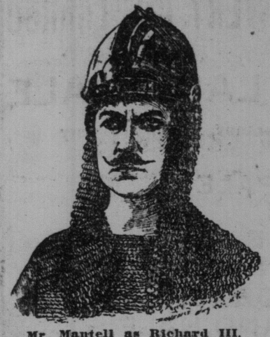
Mr. Mantell as Richard III.

Mr. Mantell in Classic Plays. Mr. Mantell and his company will close a successful engagement of six weeks from to-day. The closing week will be the record one of the engagement. The repertoire is as follows: Monday, Tuesday and Wednesday evenings, "Richard III." Wednesday matinee, "The Lady of Lyons." Thursday, Friday and Saturday evenings, "Othello." Saturday matinee, "Romeo and Juliet."