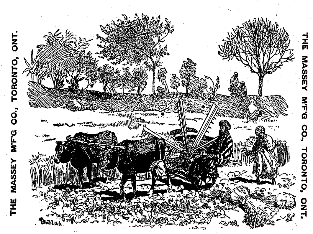
The Massey Harvester at work on the Plains of Sharon, Palestine. The first reaper of the modern style ever introduced into Palestine.