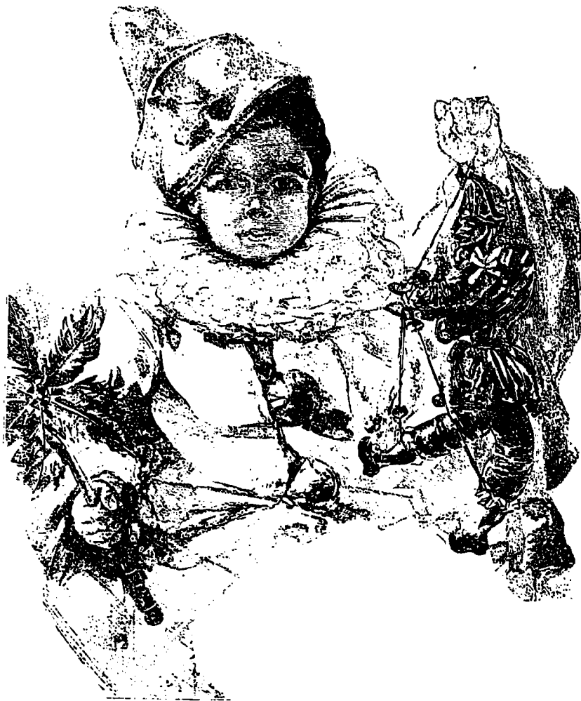
EMBLEM OF POLITICS