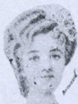
Style 7—A most GRACEFUL POMPADOUR, sloping to one side. $5.00, $7.50, $10.00 and $15.00, according to size.