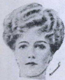
Style 5 is an ELEGANT POMPADOUR, most becoming to any face. $5.00, $7.50, $10.00