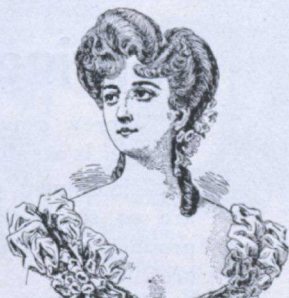
Style 3—THE LATEST of the LATEST STYLES. Most handsome and distinguished Pompadour, with low Coiffure and Curls. Full Pompadour, $10.00, $15.00 and $20.00. Curls, $2.00 each.