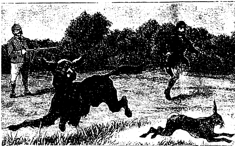
NOT QUITE STEADY AT FIRE