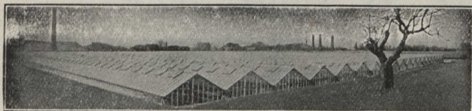
Conservatories of The Dale Estate, Brampton, Ont. Glass supplied by our Toronto Branch

GOOD QUALITY, FLAT, EVEN THICKNESS, AND WELL CUT