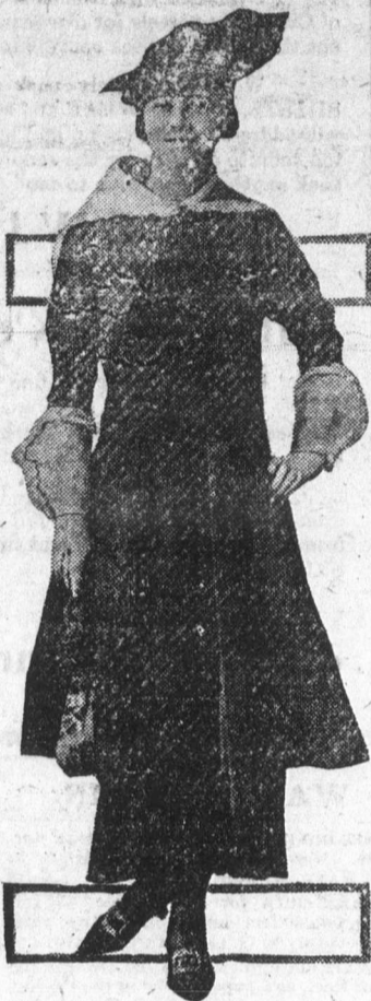
THE LATEST ONE

The smartest American designer is putting out this model set up in navy gaberdine with an interesting coat top