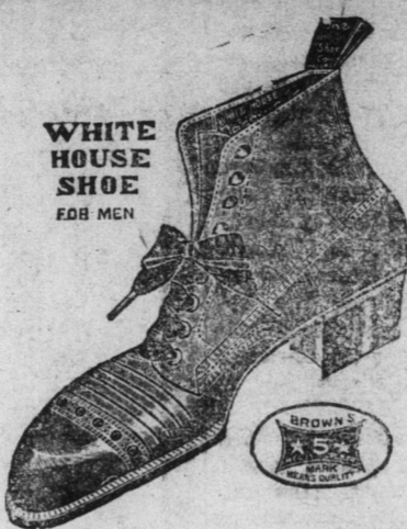
WHITE HOUSE SHOE FOR MEN

Here it is! A Man's Box Calf Blucher Boot for $3.50, $4.00, $4.50, $5.00, $5.50 and $6.00, and may be had in the following leathers: Vici Kid, Patent and Gun Metal, Button, Blucher and Laced styles. Double wear in each pair.