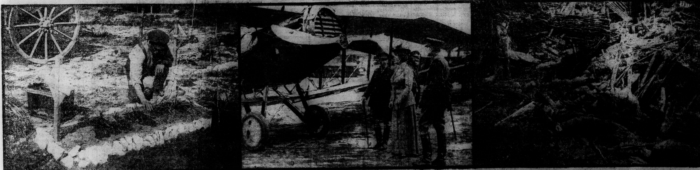
Soldiers during their spare time collect plants and flowers to decorate the graves of our fallen heroes.