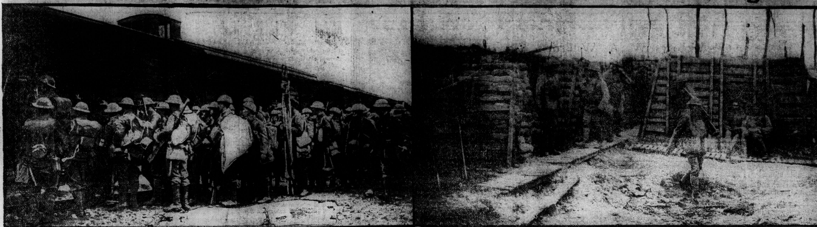
The Battle of Flanders.—Men of a midland regiment entraining after a spell in the trenches.