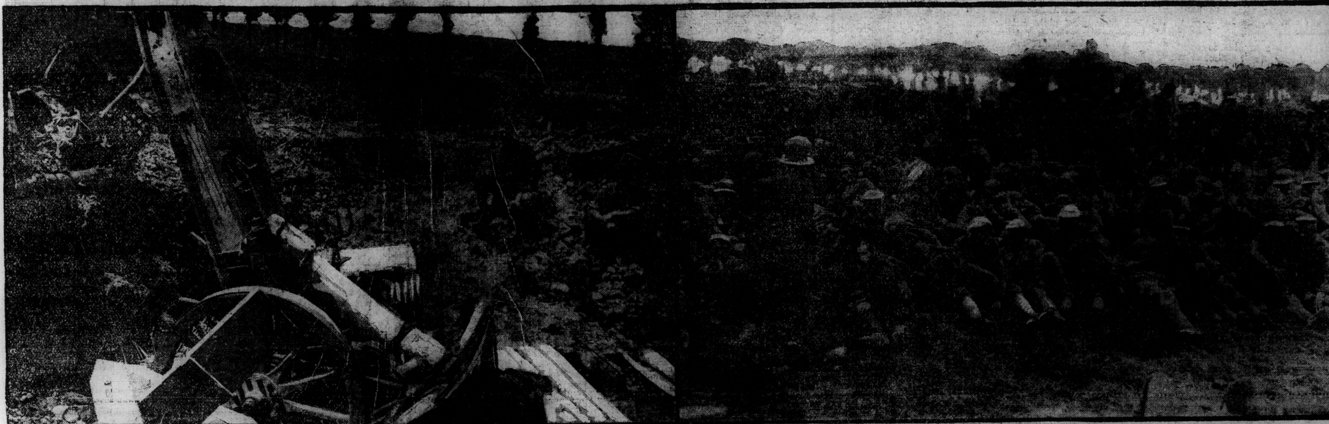
On the British Western Front.—A captured 5.9 gun in a gun position near Bullecourt.