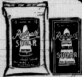
2 and 5 lb. Cans— 10, 20, 50 and 100 lb. Bags.

From "Ye Olde Sugar Loafe" of grandmother's day, to the sparkling "Extra Granulated" in your own cut-glass bowl, Redpath Sugar has appeared three times daily, for over half a century, on thousands of Canadian tables.