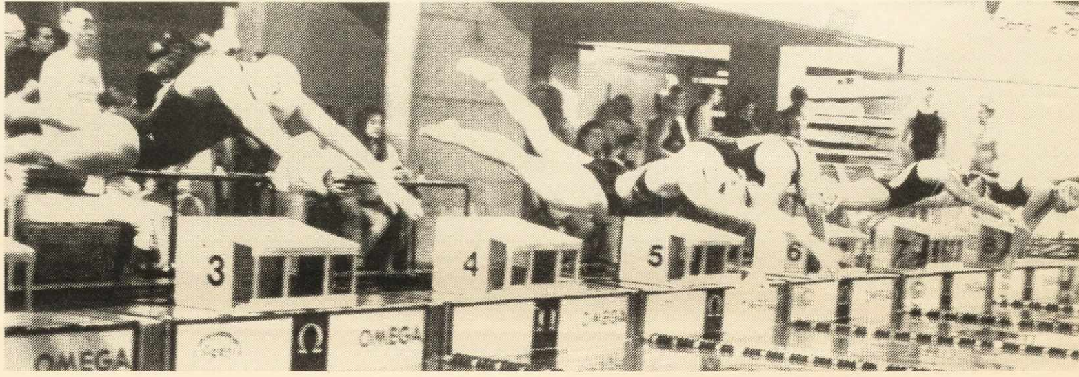
Tigers get airborne in Fredericton.

The AUAA Championship Swim Meet takes place at Dalplex Feb 17-91. Come out and support your Tigers!