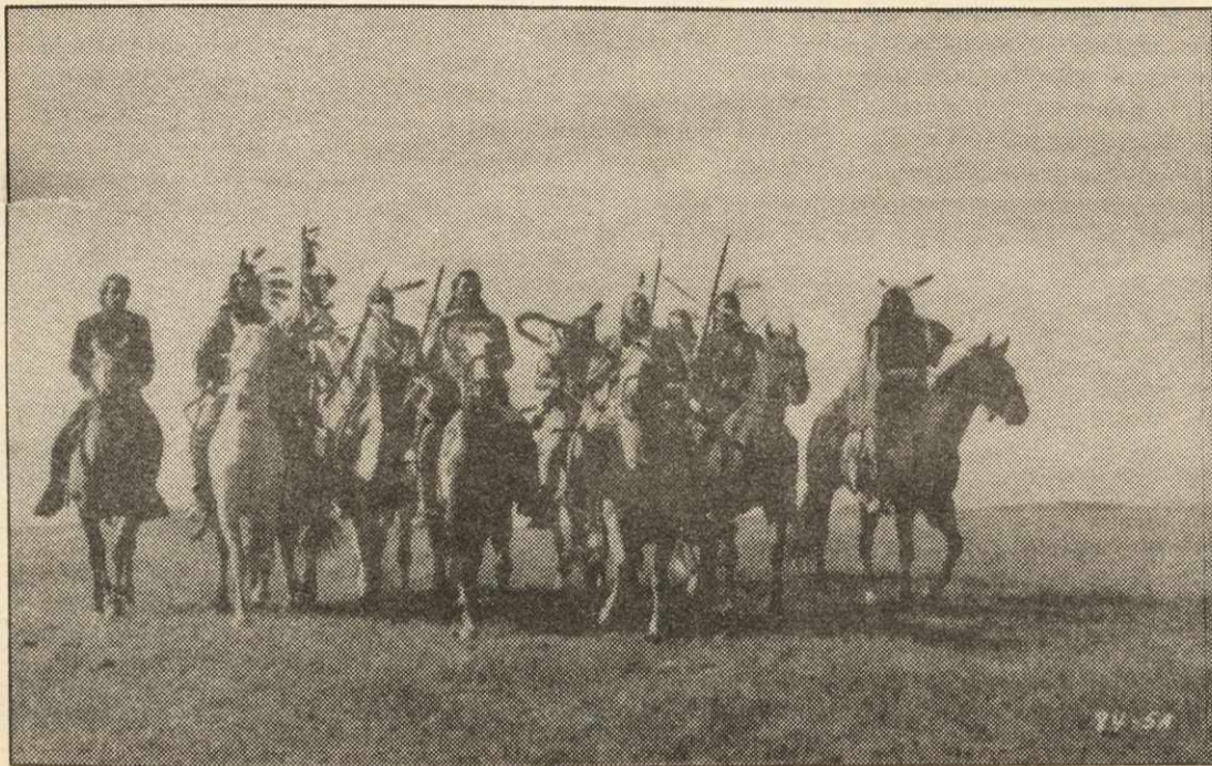
"Dances with Wolves" has been credited with portraying native Americans in a positive light.

Perhaps it was inevitable that "Glory" was the first of these stories to be filmed. After all the culture of Native People of North America has long since started to dwindle away. It should therefore come as no surprise that these disenfranchised people are the last to be recognized as victims in the Americans zealous pursuit of their "Manifest Destiny". Hopefully, emotions will be stirred by this film, and in some small way a new generation will be educated about the grave injustices committed on a once vast and civilized culture.