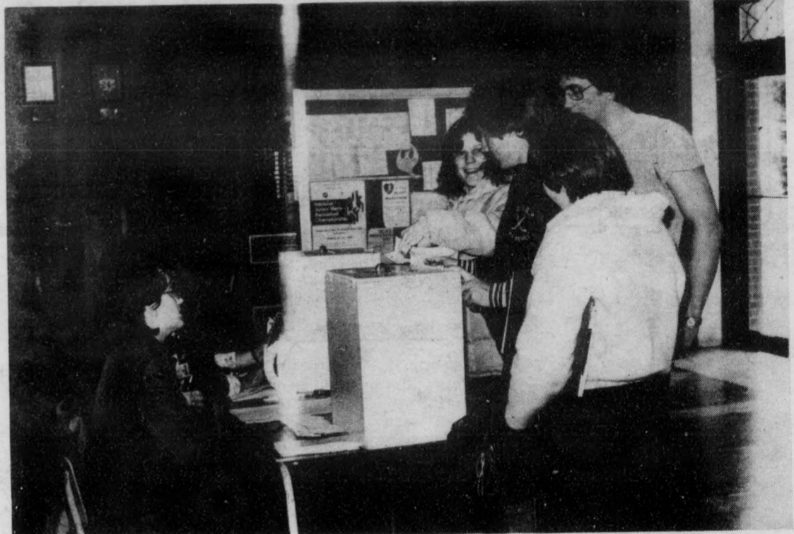
THE GYM POLLING STATION - students say no to the proposed adoption of the name 'UNB Pioneers' to replace the existing names of the varsity sports teams.