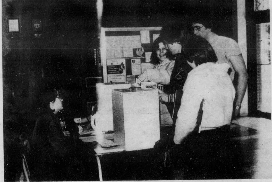
THE GYM POLLING STATION - students say no to the proposed adoption of the name 'UNB Pioneers' to replace the existing names