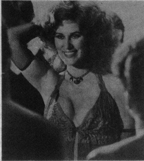
Suzanne Somers stars as the scheming, manipulative heroine of ABS' new miniseries Gone With the Winds of War , Scarlett O'Harasberg.

The series suffers from a few weaknesses — Lou Gosset Jr. strains credibility somewhat as President Roosevelt — but overall this show is a must, not to be missed, worth your while and real good besides.