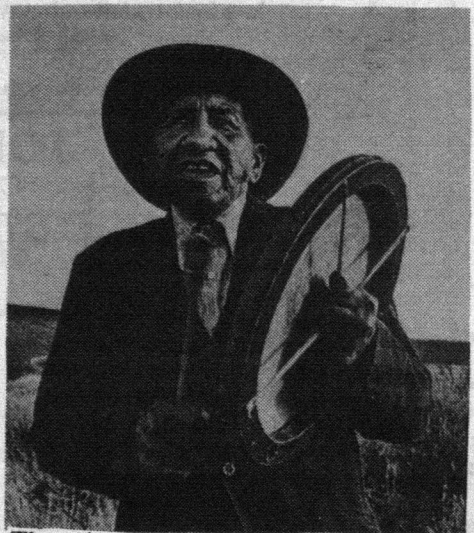
The reincarnation of Chief Dan George stars as Scarlett's dear Jewish papa, Rabbi Schmo O'Harasberg, in this blockbuster new mini-series.