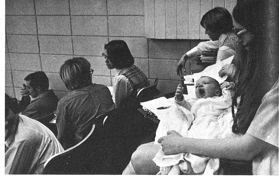
PHYSICS SURE IS (YAWN) BORING!—and Mom won't even let me read the notes. Well, maybe the prof will shut up long enough for me to dream about my day-care centre.

They also favor "preventative detention" prior to demonstrations or visits by important politicians.