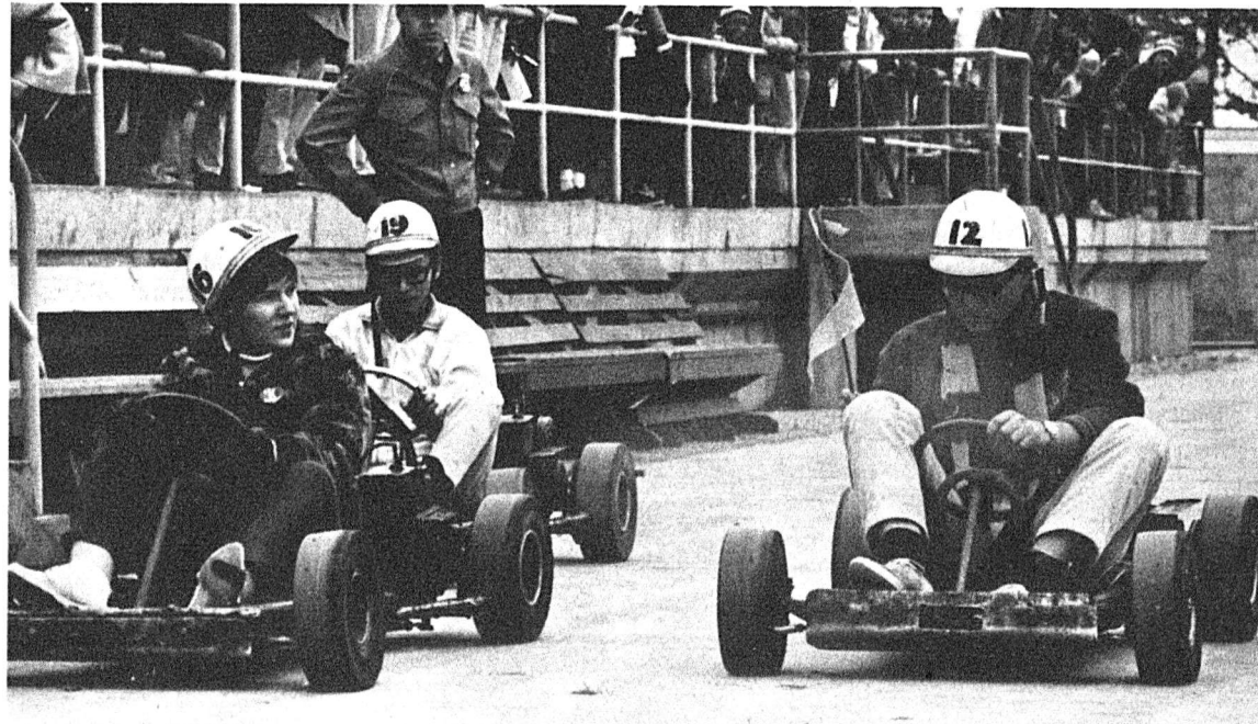
PUT IT IN GEAR BROTHER, THE FAN WON'T PULL IT!

Intersarsity Tennis —A warm-up clinic will be held on Sept. 30-Oct. 2 for all women interested. WAA competition will be held Oct. 17-18.