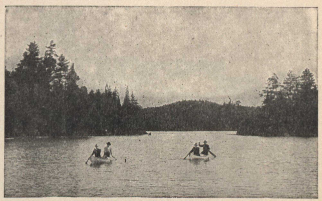
On the Montreal River, Temagami

Black bass, speckled trout, lake trout, wall - eyed pike in abundance. Moose, deer, bear, partridges and other game during hunting season.