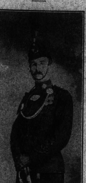
Bayswater Boy Goes To Front For Second Time

Berlin, Oct. 20.—An American newspaper correspondent today received certain information from an authoritative source regarding aerial plans which throw a new light on the action of the London aerodromes in doing away with all brilliant illumination and sweeping the skies at night with many searchlights. These precautions are thoroughly justified though a bit premature.