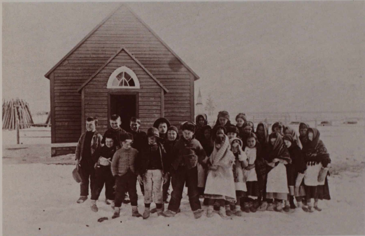
Students in Glenelg, Ontario, 1910.

They were graduated after four or five years,