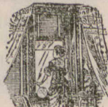
English Venetian Blinds.