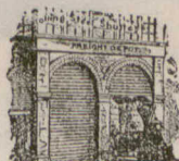
Rolling Steel Shutters