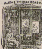
Rolling Venetian Blinds.