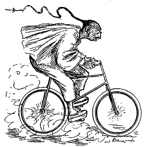
"A CYCLE OF CATHAY."